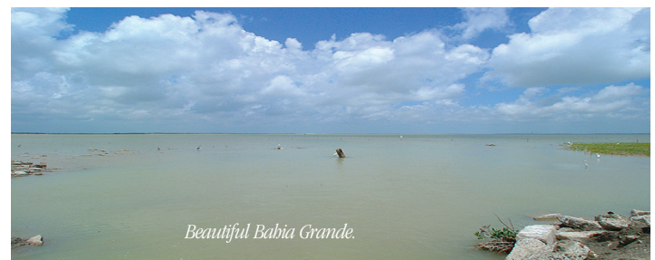
Beautiful Bahia Grande.